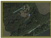
MARTIN RETREAT CENTER, DANVILLE, PA