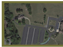
NEWMAN CENTER, SELINGROVE, PA