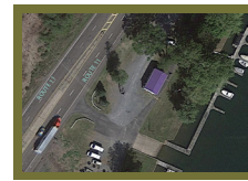
NORTHUMBERLAND BOAT CLUB, SHAMOKIN DAM, PA