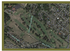
SUSQUEHANNA VALLEY COUNTRY CLUB, SELINGROVE, PA