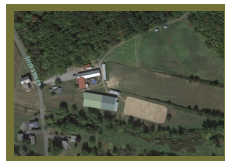
SUMMER BREEZE STABLES, MILTON, PA